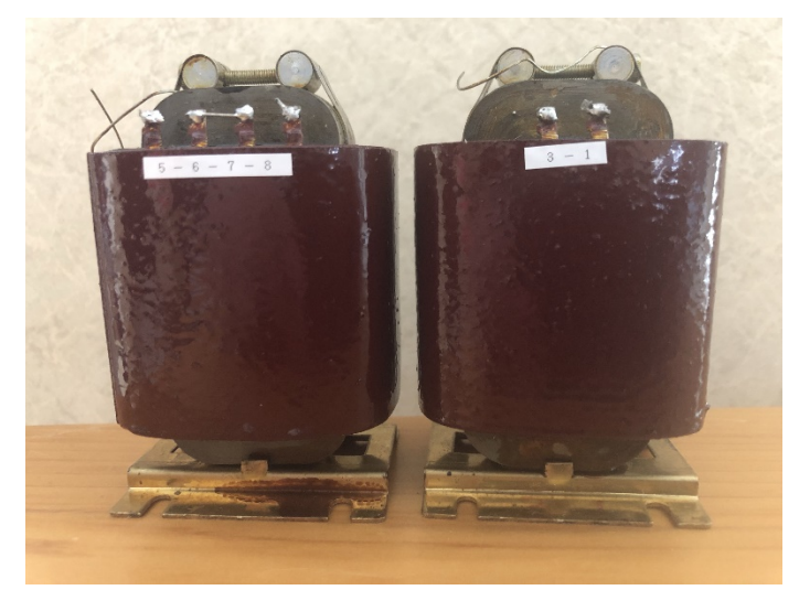
Figure 2. FM-LL1166 image

web: TheAudioFeast.com contact: CleanUnderwear@gmail.com 02/04/2019