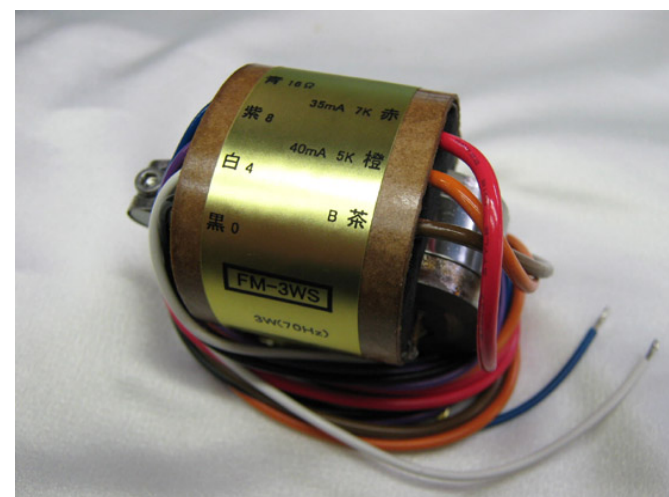
Image is FM-3WS without Urushi finish

Output 3W(70Hz) Freq. Response 25~40kHz(DC15mA 10k-8Ω -3dB ) Pri. Inductance 20H(7k) 40H(14k) 29H(10k) 1kHz DC8mA Pri. DCR 597Ω(14k) 516Ω(10k) Sec. DCR 1.46Ω(16Ω) Pri. max DC Current 25mA(14k) 30mA(10k) Dimension 65x50x65(H)mm